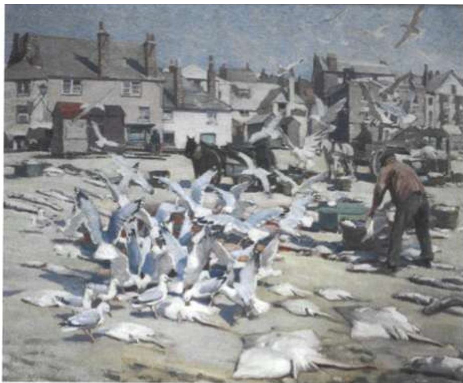
John Constable, 'The Gulls', 1826, oil on canvas, 100 x 140 cm, The Tate Gallery, London