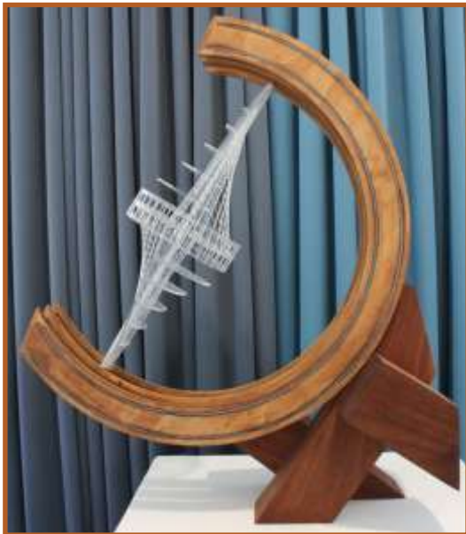
Arthur Benzing, A Level 3D Design