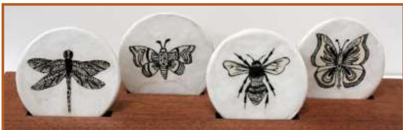
Tizzie Herival, UAL Level 3 Extended Diploma Art, Design & Communication v