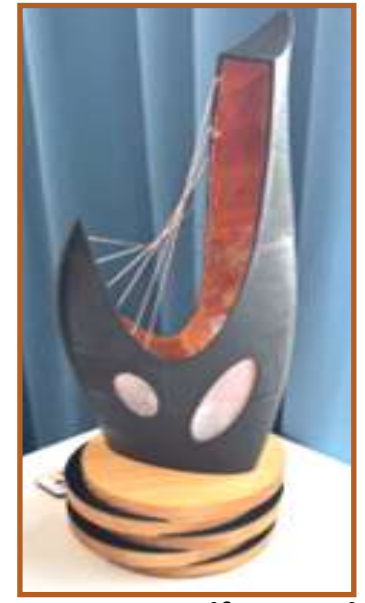
Sammy Woolf, A Level 3D Design